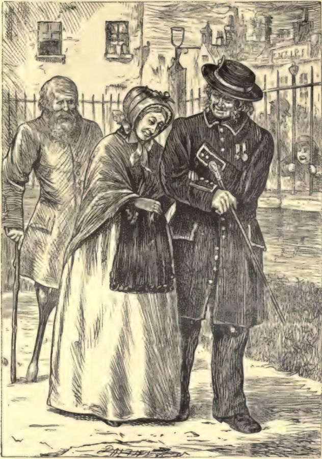
A Phenomenon at Titbull's.